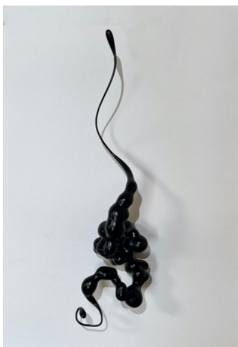
Proliferation 24-1 / lacquer, cloth, tonoko, metal / 35×10×9cm / 2024