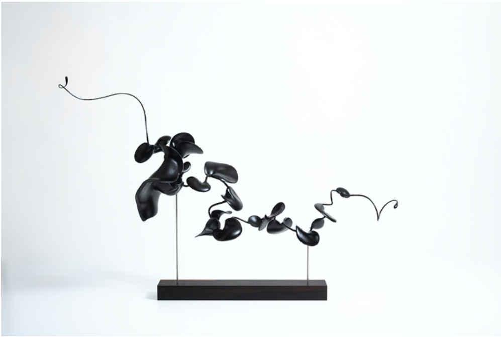
vine / h50×w92×d35cm