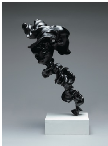
Vibration 21-1 lacquer, cloth, tonoko 67×35×25cm / 2021