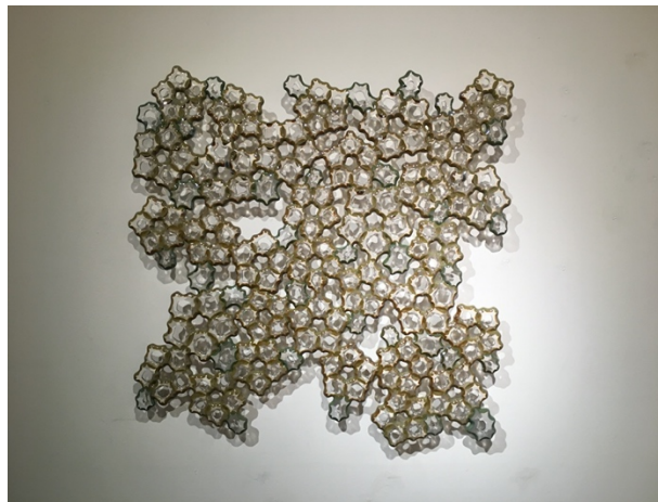
KAGUYA Mossy II / h51xw50xd0.8cm / 吹きガラス、溶着