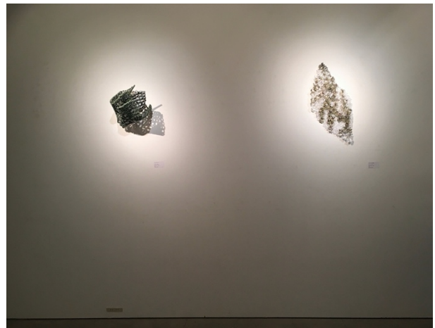
展示風景 / Installation Views