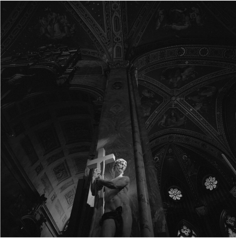
Miracle of Light VI / Platinum Print / 25.7×25.7cm