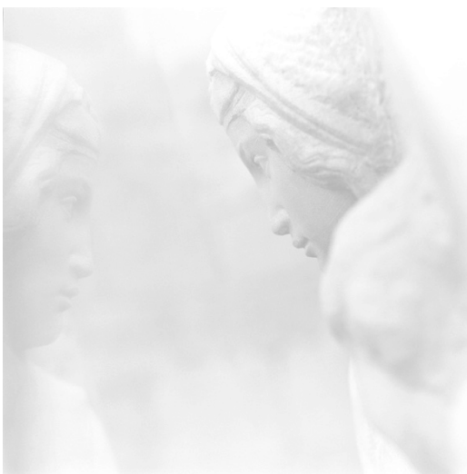
Mirror / Platinum Print / 25.7×25.7cm

*Presented to Her Majesty the Empress (Her Majesty the Empress Emerita) in 2014