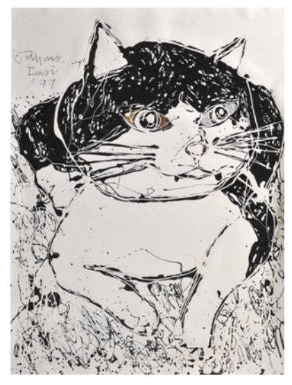
Cat / h76 \times w57cm / Enamel & acrylic on paper / 1999