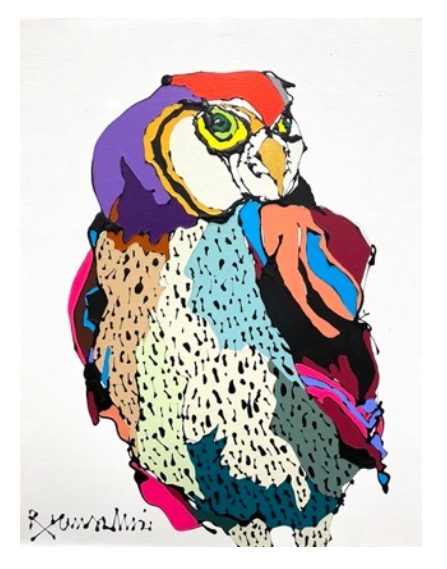
Owl / h65.2×w50×d3cm / Enamel & acrylic on canvas / 2025