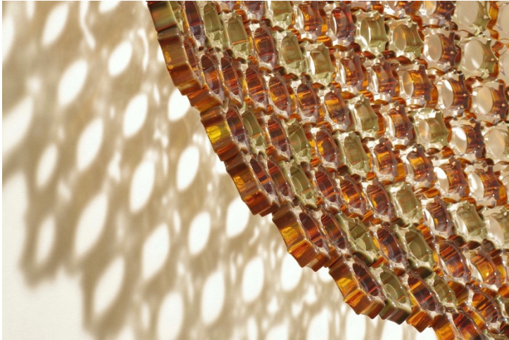
KAGUYA "Sho" / Blown Glass, Fusing h53×w33×d10cm / 2020 *part