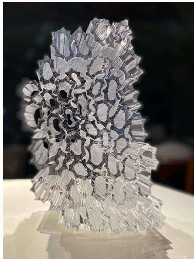
Forest I / Blown Glass, Fusing / h33×w20×d16cm / 2020