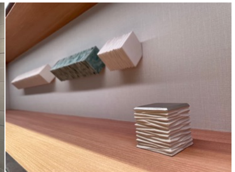
the wall of self / Commission Work/ Entrance Lounge in Apartment / 2022