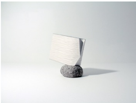
the wind of self_gstfs1 / H23×22×10cm / gesso on basswood, tin foil, stone / 2020