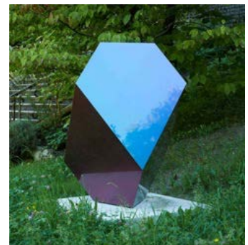
*Currently exhibiting at Skulpturenpark Kunstmuseum Liechtenstein