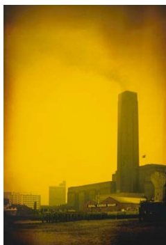
Wharf / Pigment Print, Acrylic Glasses / 60×40×0.9cm / 2014