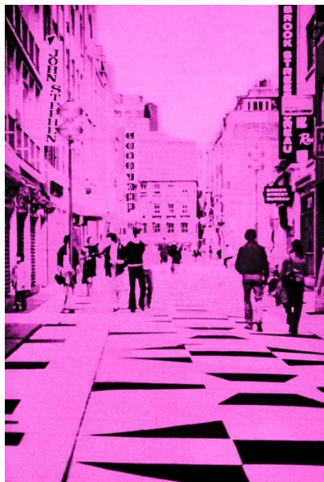
Romeo Vendrame Dedicated Followers II / Pigment Print, Acrylic Glasses / 60×40×0.9cm / 2019