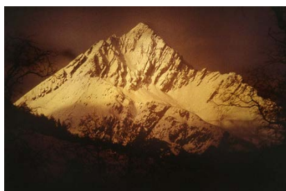
Nard III - from the series Berg / Pigment Print, Acrylic Glasses / 20×30×3.3cm / 2010