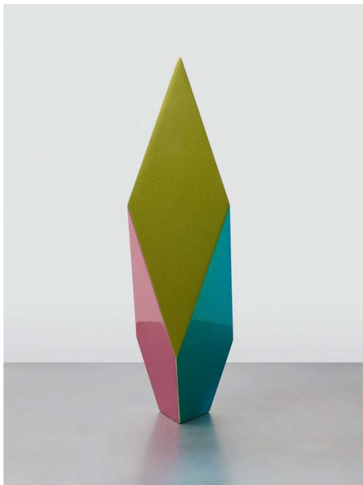
Hanna Roeckle Protostar A-1 / Dichroic Lacquer auf SWISS CDF / 41×11×10cm / 2023