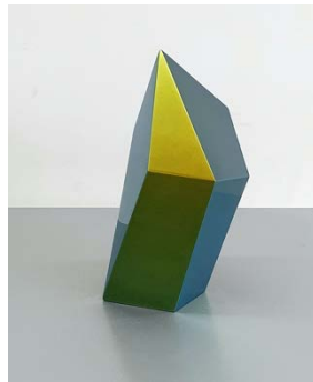
Scruit Greengold / Dichroic Lacquer and SWISS CDF / 37×12×20cm / 2021-22