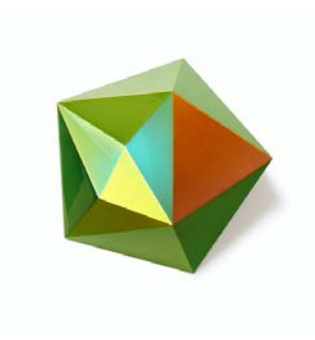
Antares / Dichroic Lacquer and SWISS CDF / 60×60×12cm / 2023