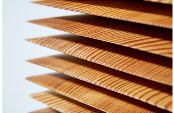
the layer of self / H39×18.5×15cm *part Japanese larch / 2020